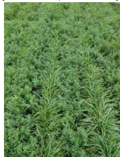
Figure 1. Spring forage in an IWG + alfalfa plot in KS as part of this study. Intermediate wheatgrass and alfalfa are planted in alternating 30 cm rows.